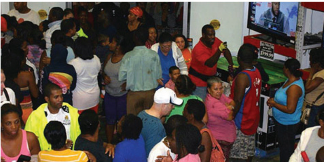
Shoppers crammed into Cost-U-Less Friday morning well before the work day started.

> Be the first person to share your comment