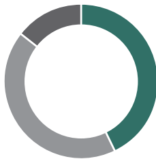
All Other NEOs

■ STIP Target 60% ■ Performance Share Units 60% ■ Options 20%