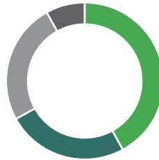
All Other NEOs

■ Base Salary 42% ■ STIP 25% ■ Performance Share Units 25% ■ Options 8%